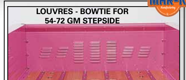
LOUVRES - BOWTIE FOR 54-72 GM STEPSIDE