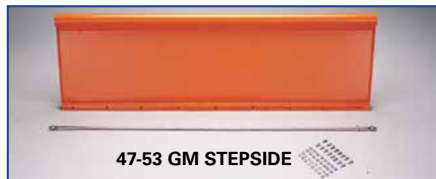
47-53 GM STEPSIDE

TechTip: The front bed panel is attached to the bed sides and the bed floor. There are some differences in how they bolt to the floors. For instance, the GM 34-46 front bed panel bolts to the bed wood, the GM 47-53 front bed panel bolts to the front cross sill, and the GM 54-87 and early Ford front panels bolt to the bed strips. All Ford 51-87 front bed panels bolt to the front cross sill. The Dodge 48-85 front bed panel mounts to the bed strips.