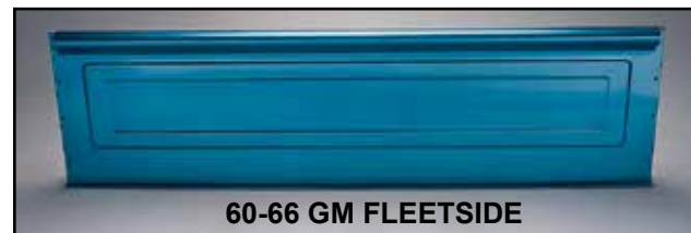
60-66 GM FLEETSIDE

*Front bed panels and rod for 34-39 will NOT fit a 39 GMC.