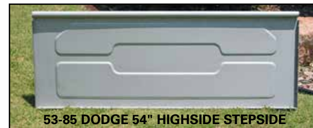
53-85 DODGE 54" HIGHSIDE STEPSIDE

Front bed panel with embossment is available for the 54" and 49" wide stepside beds. *#130148 will also fit 51-68 Power Wagons.