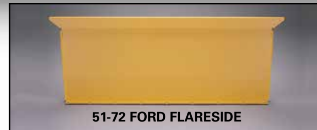
51-72 FORD FLARESIDE

The 51-72 Ford Flareside front bed panel is also available in a custom version with pointed ends that meet at the top of the bed side. To order this custom panel, use #120146.