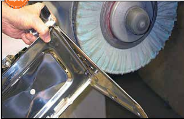
A MAR-K™ employee holds this battery tray assembly for GM 67-72 while the polishing wheel buffs it to a shine.