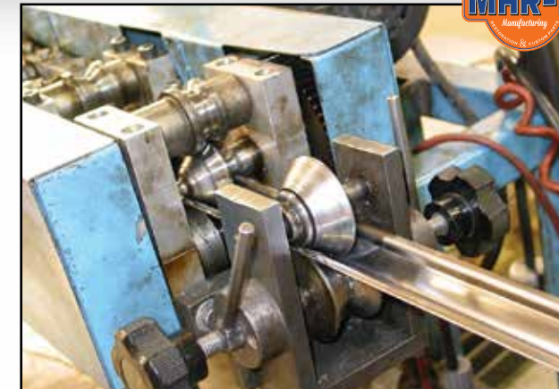
Polished stainless material goes through a special roll former to create the bend in angle strips.

CUSTOM ANGLE STRIPS - MAR-K™ can design your custom angle strips cut to any length. They can be made with or without holes. For custom hole patterns, please fill out the bed strip data sheet on page 71, and we will fit your bed! Angle strip shape and width cannot be changed.