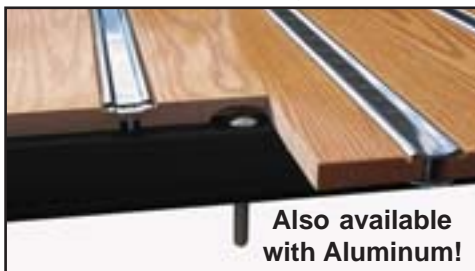
Polished Stainless Bed Strips, Hidden Fasteners Oak Wood with Hidden Mounting Holes