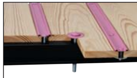
Steel Bed Strips and Zinc Plated Bolt Kit Pine Wood with Standard Mounting Holes