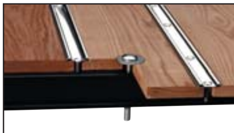
Polished Stainless Bed Strips and Bolt Kit Oak Wood with Standard Mounting Holes

Includes bed wood boards with mounting holes, bed strips and the bolts, nuts, washers and lockwashers you need to install the wood and strips in your truck. We select and machine oak bed wood from the finest quality Appalachian red oak lumber. Choose from four (4) different wood/metal combinations so your bed looks exactly the way you want it! Polished stainless/oak bed wood kit has bed strips that are precision roll formed and polished to a mirror finish in our own manufacturing shop. Kit includes brightly polished stainless bolts and offset washers. Polished stainless bed strips kit with special stainless hidden fasteners to install the bed strips include hidden bolts to attach the wood to the frame. Pine wood has steel bed strips and zinc plated bolts are supplied unpainted, but should be painted before installation. Angle strip bolts are also included with each kit.