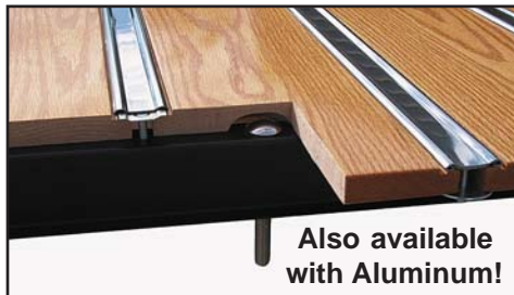
Polished Stainless Bed Strips, Hidden Fasteners Oak Wood with Hidden Mounting Holes