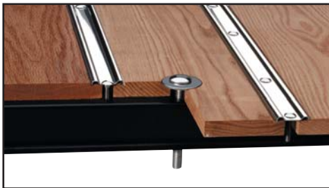
Polished Stainless Bed Strips and Bolt Kit Oak Wood with Standard Mounting Holes

Includes bed wood boards with mounting holes, bed strips and the bolts, nuts, washers and lockwashers you need to install the wood and strips in your truck. We select and machine oak bed wood from the finest quality Appalachian red oak lumber (show quality). Choose from four (4) different wood/metal combinations so your bed looks exactly the way you want it! Polished stainless/oak bed wood kit has bed strips that are precision roll formed and polished to a mirror finish in our own manufacturing shop. Kit includes brightly polished stainless bolts and offset washers. Polished stainless bed strips kit with special stainless hidden fasteners to install the bed strips includes hidden bolts to attach the wood to the frame. Pine wood (daily driver use) has steel bed strips and zinc plated bolts that are supplied unpainted, but should be painted before installation. Bolts for attaching the bed side flanges and wheel tubs to the wood floor are also included.