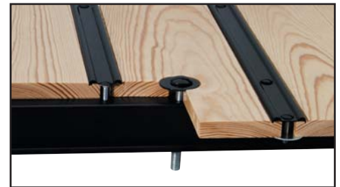
Steel Bed Strips and Zinc Plated Bolt Kit Pine Wood with Standard Mounting Holes