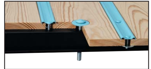
Steel Bed Strips and Zinc Plated Bolt Kit Pine Wood with Standard Mounting Holes