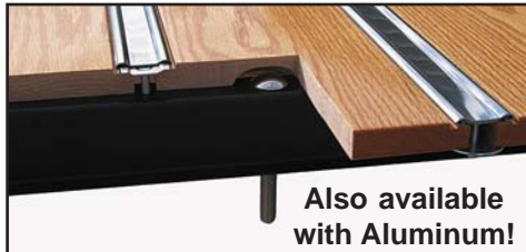
Polished Stainless Bed Strips, Hidden Fasteners Oak Wood with Hidden Mounting Holes