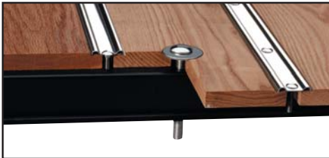
Polished Stainless Bed Strips and Bolt Kit Oak Wood with Standard Mounting Holes

Includes bed wood boards with mounting holes, bed strips and the bolts, nuts, washers and lockwashers you need to install the wood and strips in your truck. We select and machine oak bed wood from the finest quality Appalachian red oak lumber (show quality). Choose from four (4) different wood/metal combinations so your bed looks exactly the way you want it! Polished stainless/oak bed wood kit has bed strips that are precision roll formed and polished to a mirror finish in our own manufacturing shop. Kit includes brightly polished stainless bolts and offset washers. Polished stainless bed strips kit with special stainless hidden fasteners to install the bed strips includes hidden bolts to attach the wood to the frame. Pine wood (daily driver use) has steel bed strips and zinc plated bolts that are supplied unpainted, but should be painted before installation. Angle strip bolts are also included with each kit.