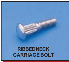
RIBBEDNECK CARRIAGE BOLT