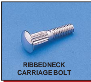
RIBBED NECK CARRIAGE BOLT