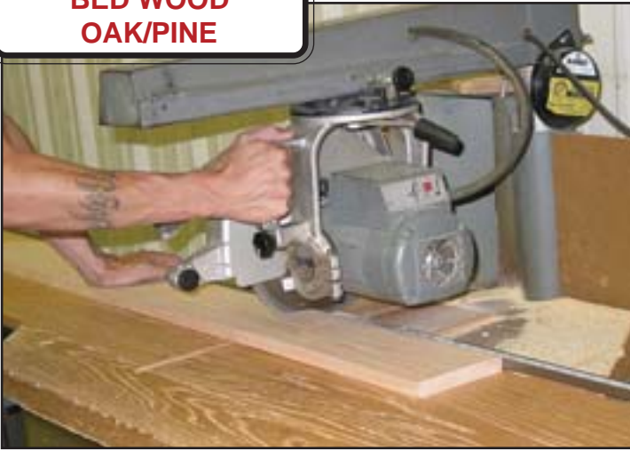
Cutting Bed Wood Boards in MAR-K's Wood Room. MAR-K grooves and cuts the boards to size.

KILN DRIED WOOD Our wood is kiln dried (NOT pressure treated). This is a process of heating the boards to reduce the amount of moisture to less than ten percent for OAK and less than 25% for PINE. Kiln drying helps prevent the boards from cracking and warping after installation. If a board looks slightly warped, try bolting it down to straighten it out.