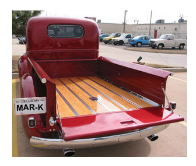
See 41-53 GM instructions or 54-87 GM instructions in our Tips & Tricks section.

This tailgate has a smooth flush look much like that of a Fleetside tailgate with a smooth tailgate cover. For Chevrolet owners, it is also available with a large Chevrolet 'Bowtie' emblem embossed in the outer skin of the tailgate. Either way, smooth or Bowtie, you will be amazed at the results. These are available for 41-53 or 54-87 GM Stepside trucks.