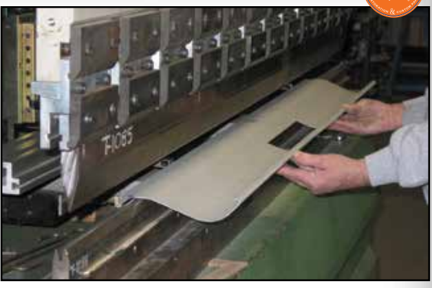
Rear Pans are formed in this press brake. Custom tools needed to make parts are designed and built at MAR-K™.