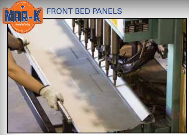
MAR-K<sup>™</sup> front bed panels for 67-72 Fleetside are spot welded on this machine. Custom built tools like this help us to make our parts accuately and efficiently.