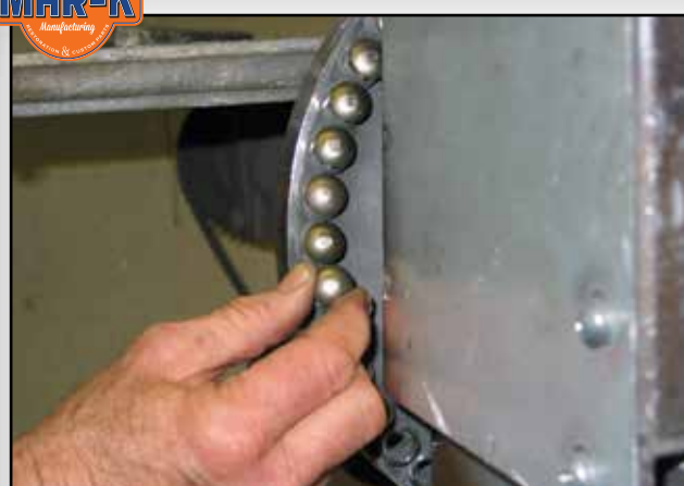
Unpolished stainless bolts are inserted into this special polishing machine to make the heads shine like chrome!