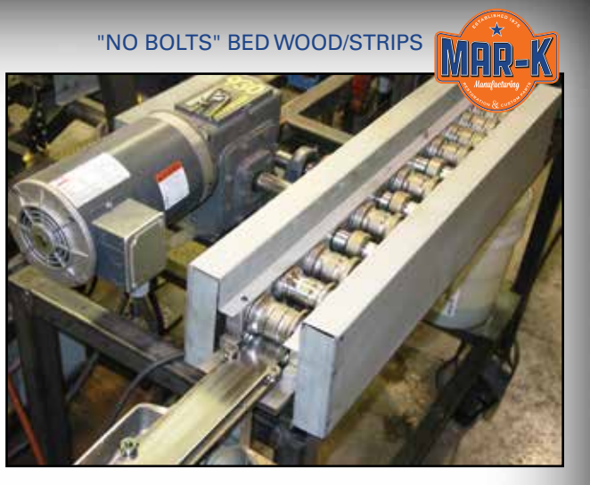
Polished stainless material is put in a roll former to make the bed strips with hidden fasteners.

No Bolts Bed Wood: The bottom surface of the wood is drilled with a recessed clearance around the bolt head. The boards and strips rest on the cross sills as original, completely hiding the bedto-frame and bed strip bolts.