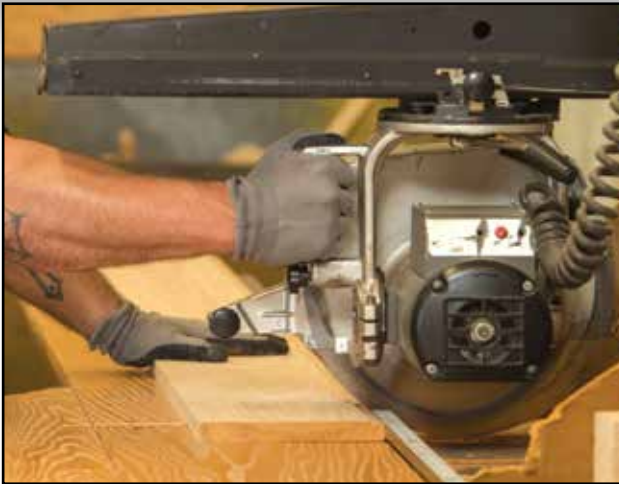
Cutting Bed Wood Boards in MAR-K's™ Wood Room. MAR-K™ wood boards are grooved and cut to size.

KILN DRIED WOOD Our wood is kiln dried (NOT pressure treated). This is a process of heating the boards to reduce the amount of moisture to less than 10% for OAK and less than 25% for PINE. Kiln drying helps prevent the boards from cracking and warping after installation. If a board looks slightly warped, try bolting it down to straighten it out.