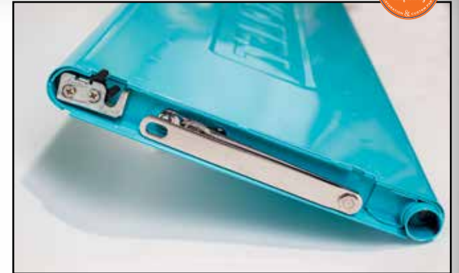
47-53 GM STEPSIDE - "CHEVROLET" SCRIPT (SIDE VIEW)