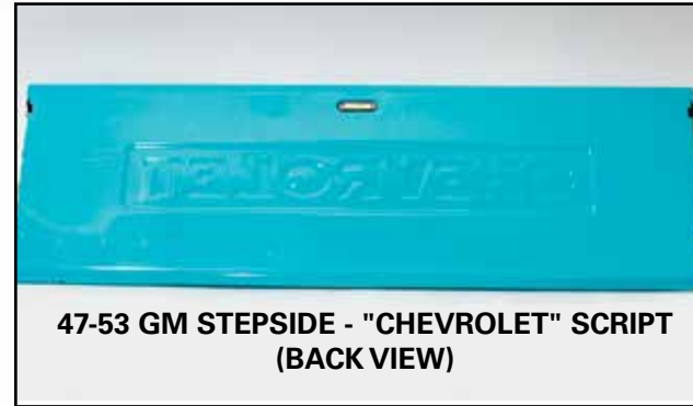
47-53 GM STEPSIDE - "CHEVROLET" SCRIPT (BACK VIEW)