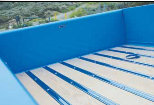
Inside view of the push button tailgate in closed position on the 1954 Chevy Thriftmaster made by Jonathan Ward, ICON.

MAR-K™ makes complete tailgates for GM Stepsides modified to use inner push button mechanism and link assemblies to give your truck a radical new look. The latches and links are inside the tailgate hidden from view. This tailgate is perfect for those who want the traditional style without the chains, which are noisy and sometimes damage the paint finish. Tailgates are made of 16 gage electrogalvanized steel or grade 5052 aluminum in Oklahoma City, USA! Included with the tailgate are instructions and a customizing kit to convert stock bed sides to work with the hidden latches and links. MAR-K's™ bed sides are available with the upgrade to work with these tailgates! To order the upgrade with your bed side order, use part number 103077, order one upgrade per bed side.